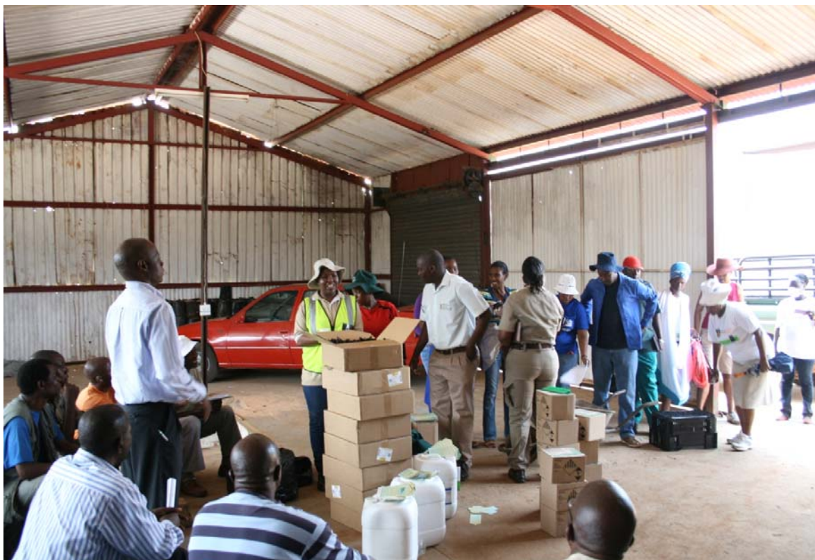
Fig. 2 Farmers' meeting during the distribution of chemicals funded by government for eradication and suppression of B. dorsalis in Deerpak area, Greater Tzaneen Municipality.

The Chempac and McPhail Methyl- eugenol baited traps were used. These were initially placed around detection points, according to SABIFF [30-32]. A total of 437 traps have been set in the quarantine areas in the Mopani District Municipality. In addition, about 30 McPhail protein Biolure® baited traps, were also placed in this district. Traps were checked weekly for a period of 5 months, and thereafter, they were checked,