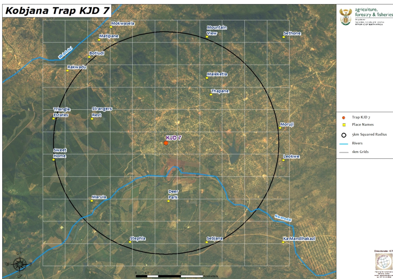
Fig. 1 Map of the Deerpak area in Greater Tzaneen Local Municipality used to indicate the delimited area of 5 km 2 (surrounding the area of detection) under quarantine after the detection of two flies, in 2013.

EC (500 g/L) were hung on the host trees at the rate of 4 MAT blocks per hectare. MAT blocks were replaced after every 8 weeks. M3 bait stations were also deployed at a density of 300-400 units per hectare and were replaced after 1-4 months. Collected fruit were discarded in trenches dug in most production areas and covered with a soil layer of approximately 500 mm.